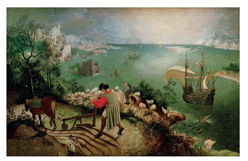
Fig. 2. Pieter Bruegel the Elder, Landscape with the Fall of Icarus , ca. 1560. Oil on canvas, 73.5 \text{ cm} \times 112 \text{ cm} (28.9 in \times 44 in). Royal Museums of Fine Arts of Belgium, Brussels.

The contrast between those who endure suffering and those who remain apathetic towards it engenders a division in their respective stances, thereby amplifying the disparity in societal sensibilities. In referencing Bruegel's depiction of Icarus's demise, Auden expands upon the theme by illustrating the prevalent disregard as an emblematic trait of a degenerating society. The ploughman, who might have been a witness to Icarus's fall, exhibits a detachment, indicative of a narrow-minded outlook. Similarly, the passing ship overlooks the event, and Icarus, being swallowed by the sea, is shunned by the self-absorbed populace. Paradoxically, while mythological discourses celebrate the allegorical dimension of Icarus's tragic death, the individual (human) tragedy seems to be, at best, of secondary importance.