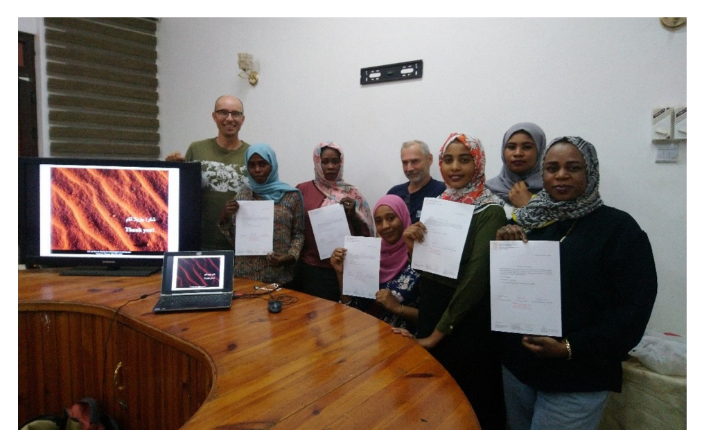
Fig. 3. Students and graduates received certificates on the last day of the field school. (Photo: Amal Awad).