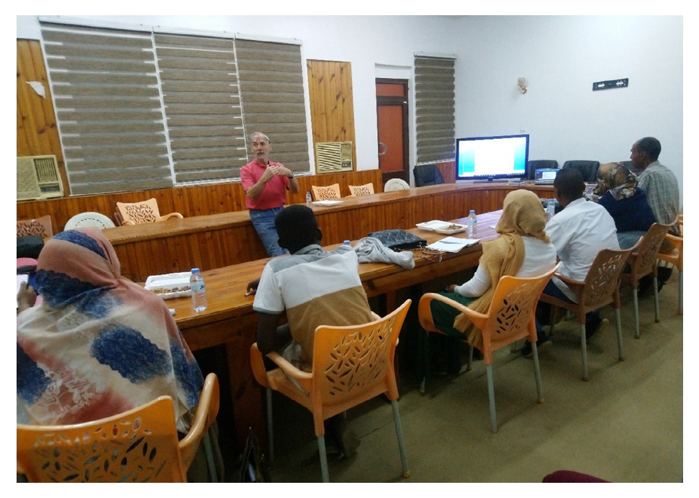
Fig. 4. During the workshop for experienced researchers.