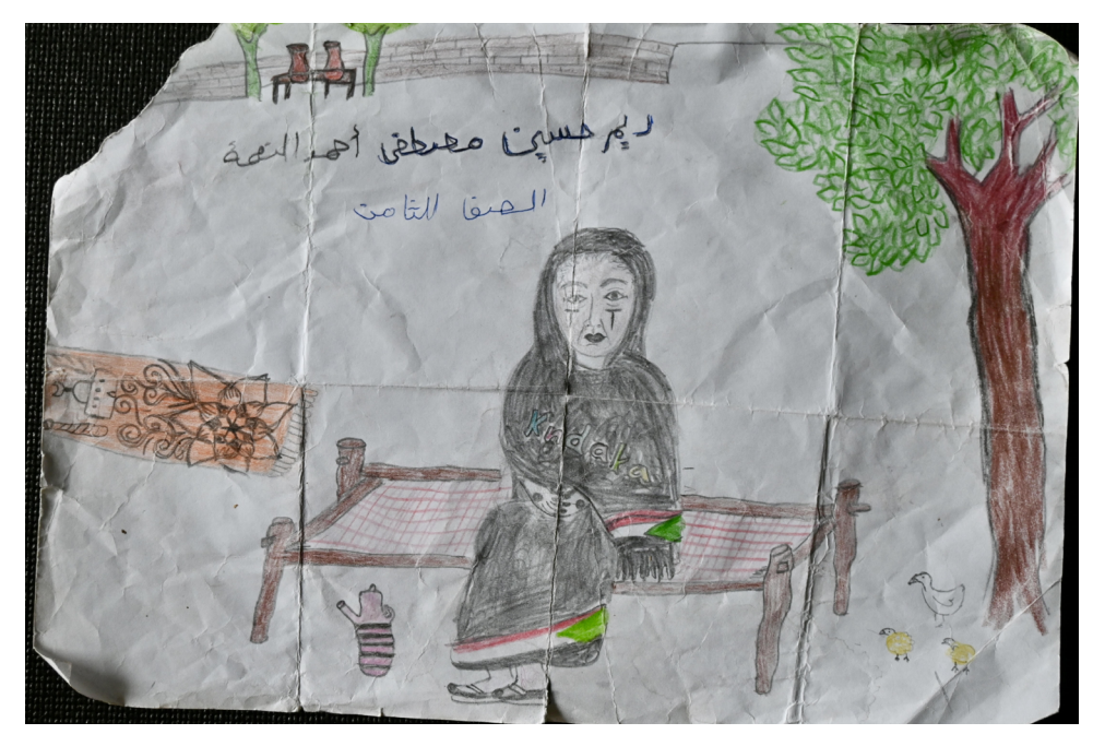
Fig. 1. Drawing by one of the pupils from the Primary School in Soba-Gana'ab.

Our discussions undoubtedly had an impact on the drawings prepared by the children who participated in the workshops. Most of the issues raised during the meetings were incorporated in the drawings. The works can be divided into the following general groups: