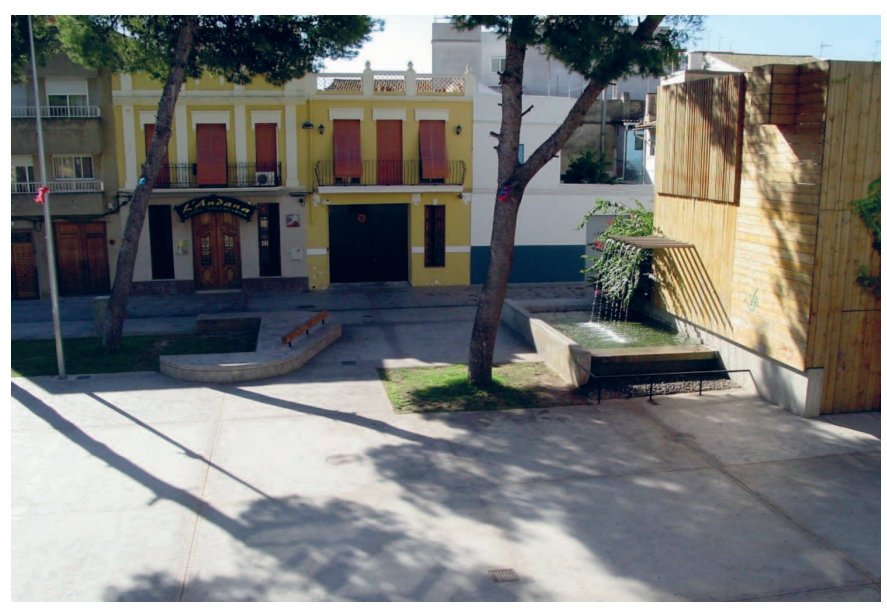
Figure 2 Massanassa Town Hall square built in 2003 by the text's authors. This project revitalises an old school courtyard and its pine trees as a public square in this small town