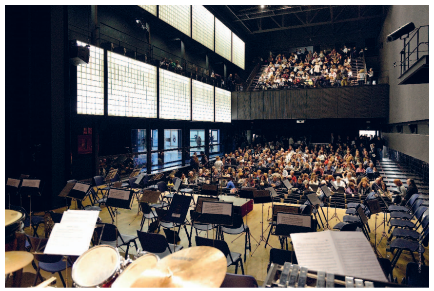
Figure 3 Massanassa Auditorium completed in 2015 by the text's authors. This project operated looking for possibly most diverse spectrum of uses, from school plays to professional concerts.